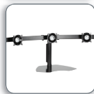
KTP320 / KTP325 Triple Horizontal Table Stand (standard/widescreen)