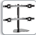
KTP445 Widescreen Quad Monitor Table Stand