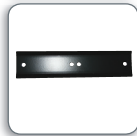
KTA1001 ■ Array Connector

For a complete list of monitor mount accessories see page 121.