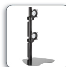
KTP230 Dual Vertical Table Stand