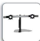
KTP225 Widescreen Dual Table Stand