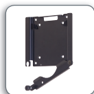
KSA1024 ■ Centris Quick-Connect Interface