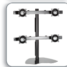
KTP440 / KTP445 Quad Monitor Table Stand (standard/widescreen)