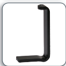
KSA1008 ■ Extended Desk Clamp Bracket – Compatible with 2.5" - 5" (64-127 mm) thick surfaces