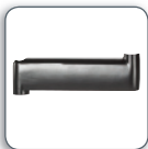
KSA1003 ■ Extension Arm – Maximum of 3 arms – Weight capacity is reduced to 30 lbs (13.6 kg)