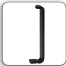
KSA1012 ■ Extended Reach Desk Clamp Bracket