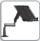
KGL110 Height-Adjustable Laptop Desk Mount